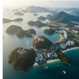
لانكاوي - ماليزيا