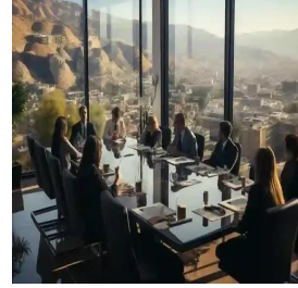
عمان - المملكة الأردنية الهاشمية