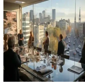
مدريد - إسبانيا