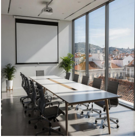
لشبونة - البرتغال