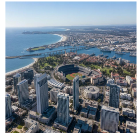
سان دييغو - الولايات المتحدة الأمريكية