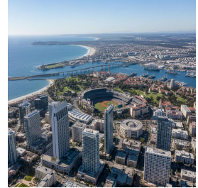
سان دييغو - الولايات المتحدة الأمريكية