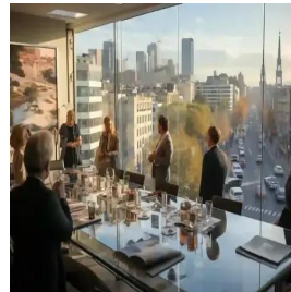
مدريد - إسبانيا