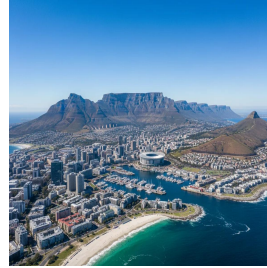
كاب تاون - جنوب إفريقيا