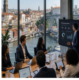
بورتو - البرتغال