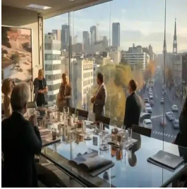
مدريد - إسبانيا