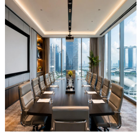
سنغافورة - سنغافورة