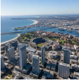
سان دييغو - الولايات المتحدة الأمريكية