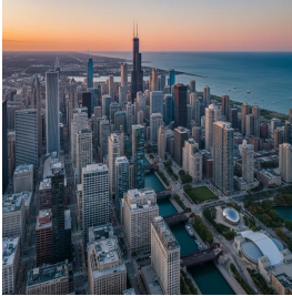
شيكاغو - الولايات المتحدة الأمريكية