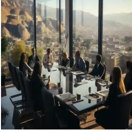
عمان - المهلكة التردنية الهاشمية