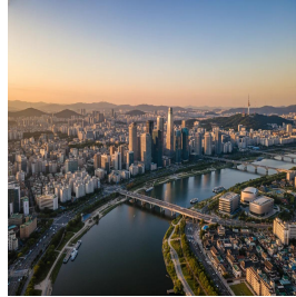
سيول - كوريا الجنوبية