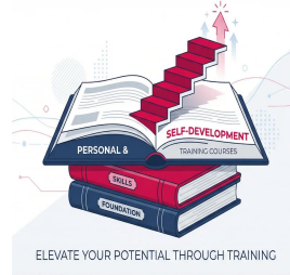
دورات المهارات الشخصية وتطوير الذات