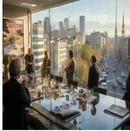
مدريد - إسبانيا