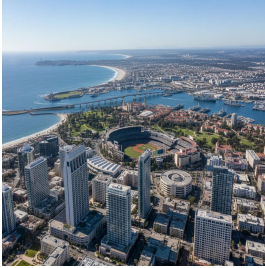
سان دييغو - الولايات المتحدة الأمريكية