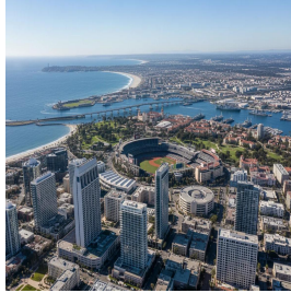
سان دييغو - الولايات المتحدة الأمريكية