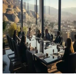
عمان - المملكة الأردنية الهاشمية