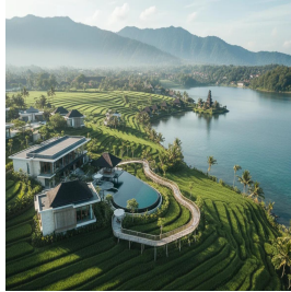
بالي - جمهورية اندونيسيا