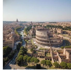
روما - إيطاليا