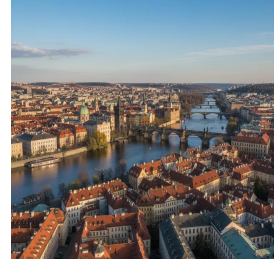
براغ - جمهورية التشيك