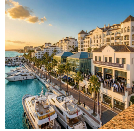
ماربيا - إسبانيا