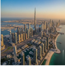
دبي - الإمارات العربية المتحدة