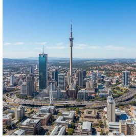
جوهانسبرغ - جنوب إفريقيا