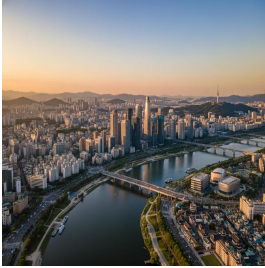
سيول - كوريا الجنوبية