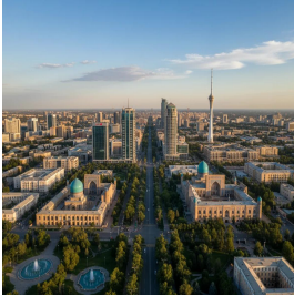
طشقند - أوزبكستان