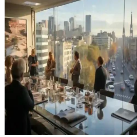
مدريد - إسبانيا