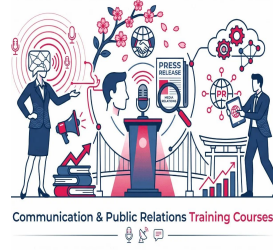
Communication & Public Relations Training Courses

دورات التدريب القانوني والمشتريات والتعاقدات