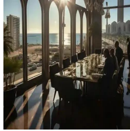
الدار البيضاء - المغرب