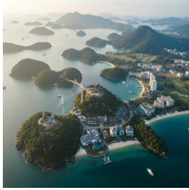
لانكاوي - ماليزيا