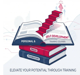
دورات المهارات الشخصية وتطوير الذات