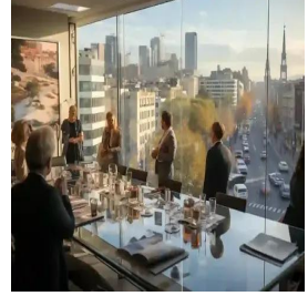
مدريد - إسبانيا