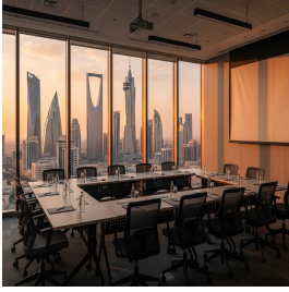
الرياض - المملكة العربية السعودية