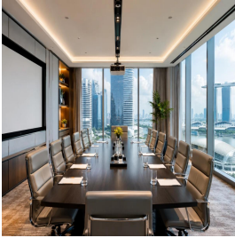
سنغافورة - سنغافورة