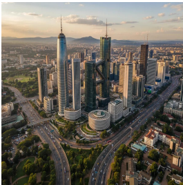
نيروبي - كينيا