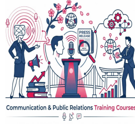
Communication & Public Relations Training Courses

دورات التدريب القانوني والمشتريات والتعاقدات