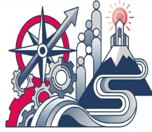
دورات في مجالات القيادة والإدارة