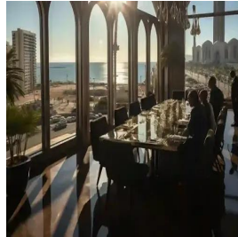
الدار البيضاء - المغرب