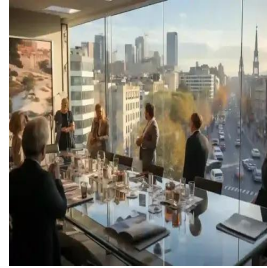
مدريد - إسبانيا