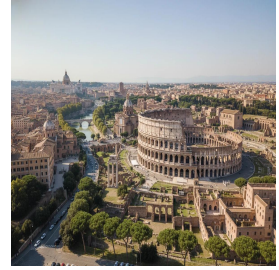
روما - إيطاليا