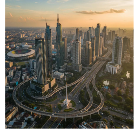
جاكرتا - جمهورية إندونيسيا