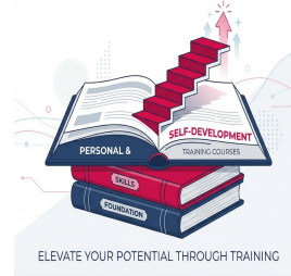
دورات المهارات الشخصية وتطوير الذات