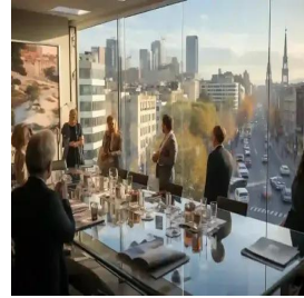
مدريد - إسبانيا