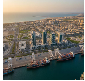
الجبيل - المملكة العربية السعودية