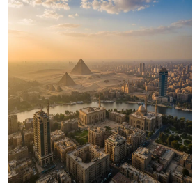
القاهرة - مصر