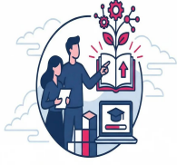
HR TRAINING & DEVELOPMENT