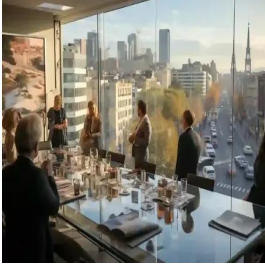
مدريد - إسبانيا