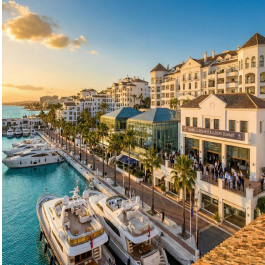
ماربيا - اسبانيا