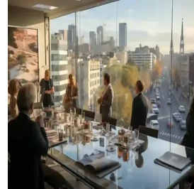
مدريد - إسبانيا