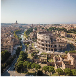
روما - إيطاليا