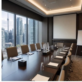
تورنتو - كندا