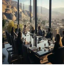
عمان - المهلكة الأردنية الهاشمية