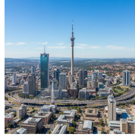
جوهانسبرغ - جنوب إفريقيا