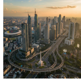
جاكرتا - جمهورية إندونيسيا