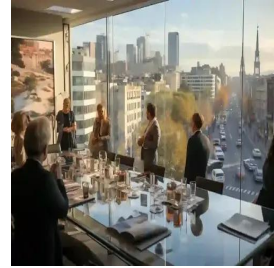
مدريد - إسبانيا