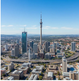
جوهانسبرغ - جنوب إفريقيا