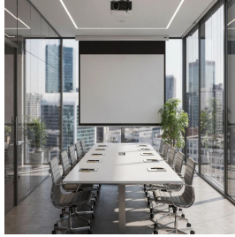
فرانكفورت - ألمانيا