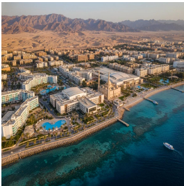
شمر الشيخ - مصر