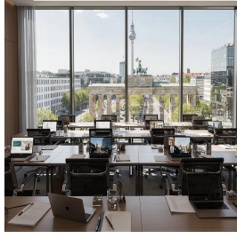
برلين - ألمانيا