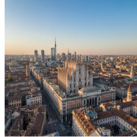
ميلان - إيطاليا