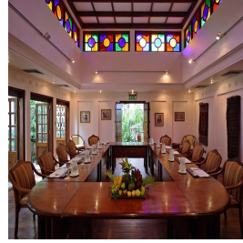
زنجانر - تنزانيا