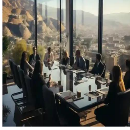
عمان - المهلكة النردنية المشهية