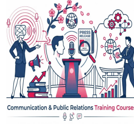
Communication & Public Relations Training Courses

دورات التدريب القانوني والمشتريات والتعاقدات