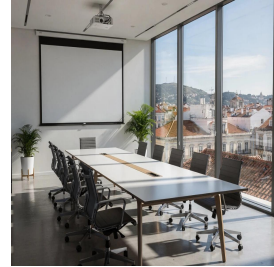
لشبونة - البرتغال