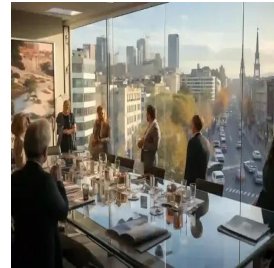
مدريد - إسبانيا