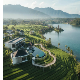
بالي - جمهورية إندونيسيا