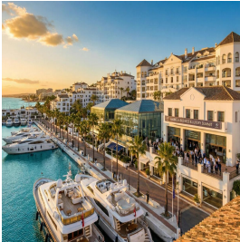
ماربيا - اسبانيا