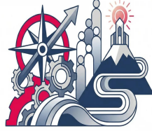
دورات في مجالات القيادة والإدارة