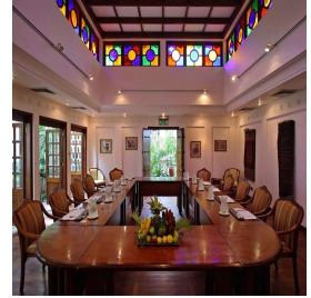
زنبار - تنزانيا