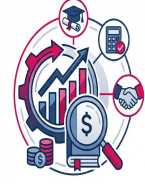
دورات المحاسبة و التمويل و دورات الإدارة الهائية