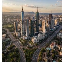
نيروبي - كينيا