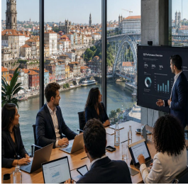
بورنو - البرتغال