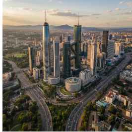
نيروبي - كينيا