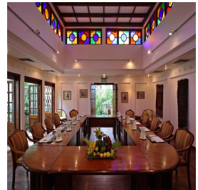
زنبار - تنزانيا