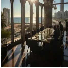
الدار البيضاء - المغرب