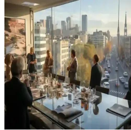
مدريد - إسبانيا