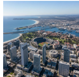
سان دييغو - الولايات المتحدة الأمريكية