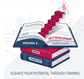
دورات المهارات الشخصية وتطوير الذات