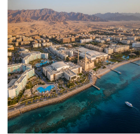
شرم الشيخ - مصر