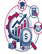
دورات المحاسبة و التمويل و دورات الإدارة الهائية