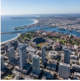
سان دييغو - الولايات المتحدة الأمريكية