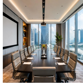
سنغافورة - سنغافورة