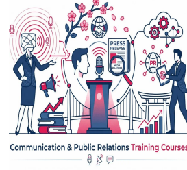
Communication & Public Relations Training Courses

دورات التدريب القانوني والمشتريات والتعاقدات